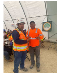
The Heavy Civil and RSIT projects in Orange, TX celebrated National Safety Week with a BBQ luncheon and some raffle prizes! This project team, with the support of our client continues to exceed safety expectations by going above and beyond to make sure everyone goes home safely every day.